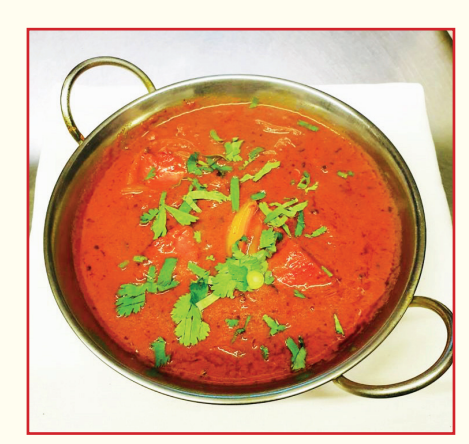
CHICKEN TIKKA BALTI